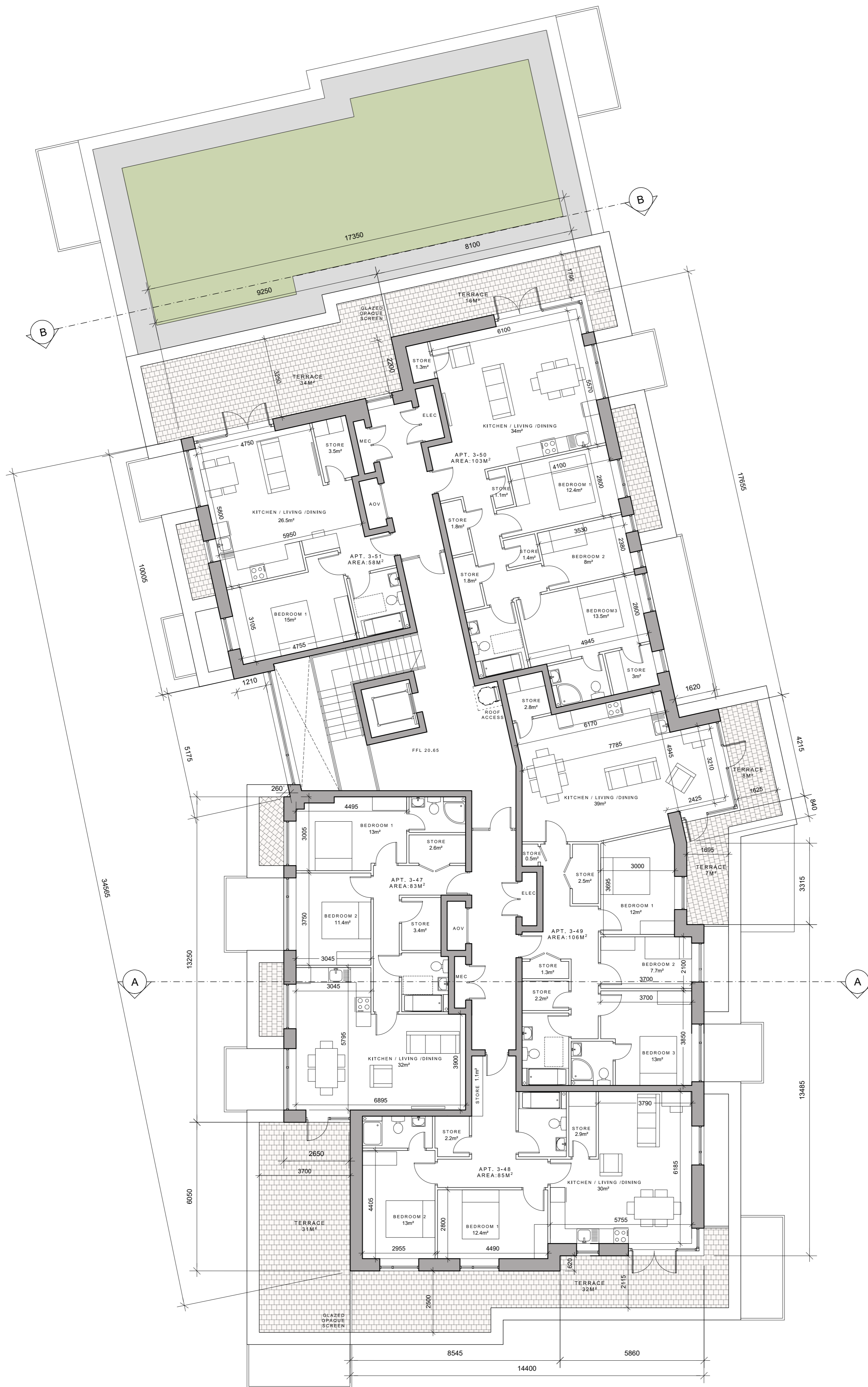
BLOCK 3 FOURTH FLOOR PLAN SCALE: 1:100